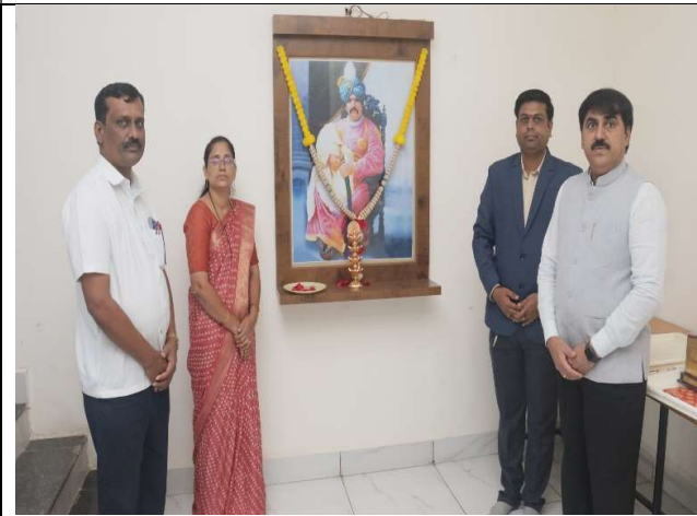
Glimpses of the Programme