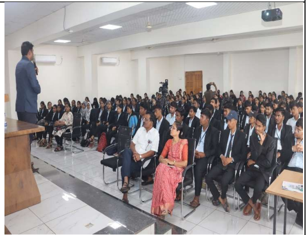
Attendees of the Programme

D) Link of Video of the programme if any: -